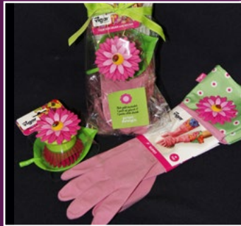
FLOWER GLOVES + BRUSH CODE: 9 $20