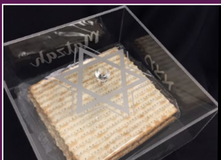
PERSPEX MATZAH BOX CODE: 13 $40