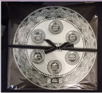
GLASS SEDER PLATE CODE: 11 $45