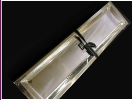
LONG STAINLESS STEEL PLATTER CODE: 5 $35