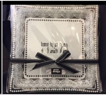
GLASS MATZAH TRAY CODE: 7 $40