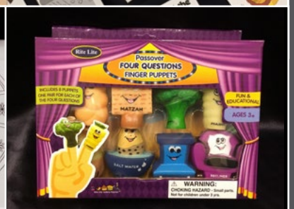
Four questions finger puppets Code: 19 $20