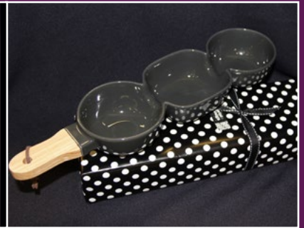
SERVING STICK (WOOD / PORCELAIN) CODE: 12 $25