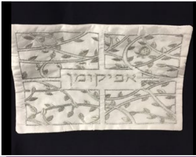
AFIKOMAN BAG CODE: 6 $20