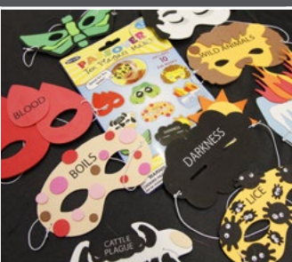
Ten plagues masks Code 17 $15