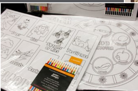
Kids colouring-in placemats, 12 pack Code: 18 $12