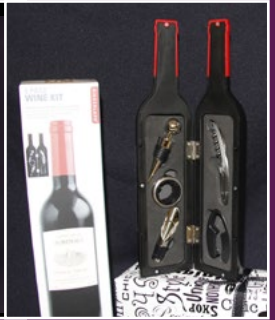
WINE ACCESSORY SET CODE: 8 $30