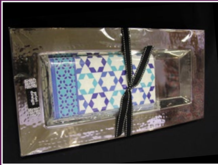
STAINLESS STEEL PLATTER + 1PKT SERVIETTES CODE: 1 $35