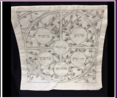
MATZAH COVER CODE: 4 $35