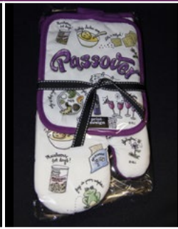
2 PC OVEN MITS CODE: 3 $20