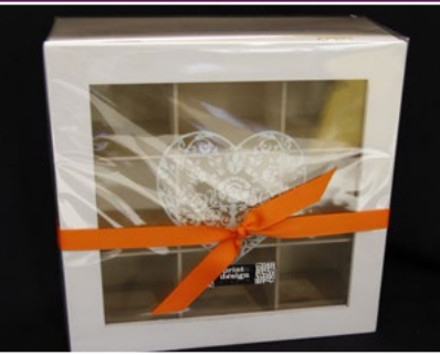
TEA BOX CODE: 2 $30