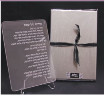
SHABBAT PRAYER CODE: 10 $30